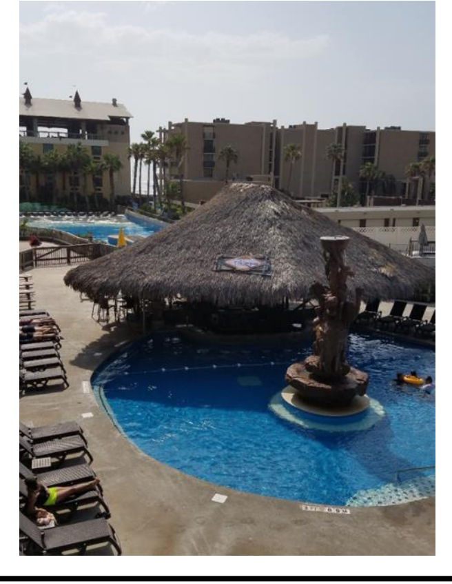
Oh yes, that is a heated pool at the Schlitterbahn Resort!