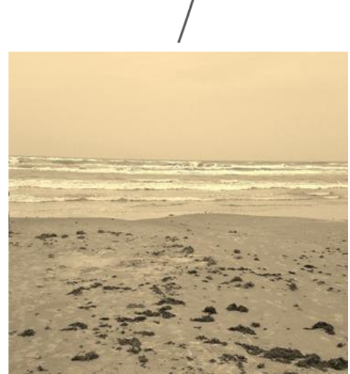
Beautiful cloudy day on the beach!