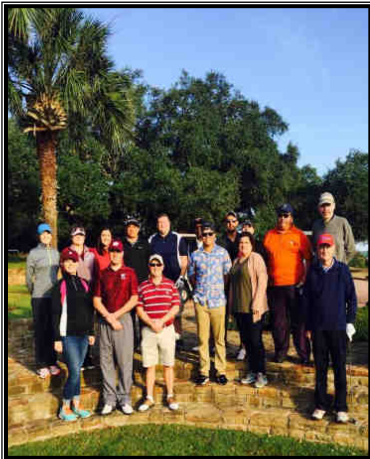
Participants from the annual TACRAO Golf Tournament, held at Horseshoe Bay Resort.